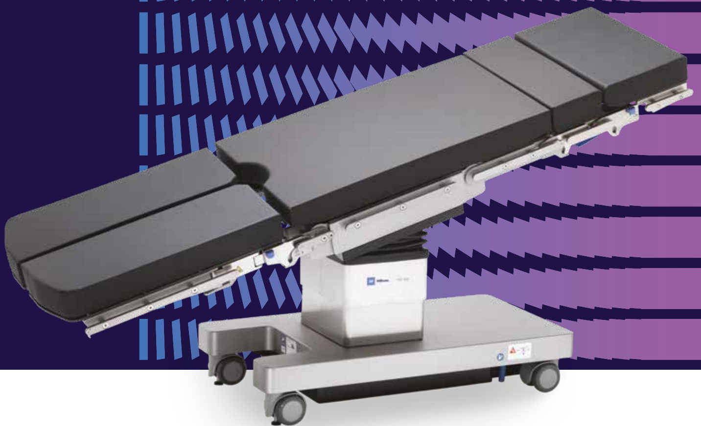
PST 300 Precision Surgical Table